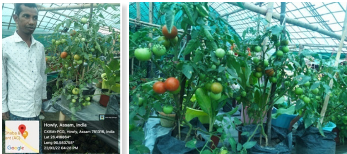
Fruiting stage of Grafted plants