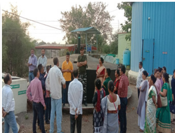
Team from Assam at Agasti FPO, Sangamner

On day 3, the team visited Agasti FPO, developed under MACP and AHD related activities such as silage fodder management. BoDs of Assam had experience sharing on the operation of the common service centre and got to understand the paddy-Vegetables cropping sequence, which can be replicated in Assam. Agasti FPO team explained the management practice of fodder and silos with their experience, which