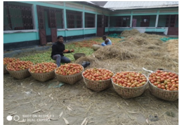
Harvested Tomatoes-ready for sale