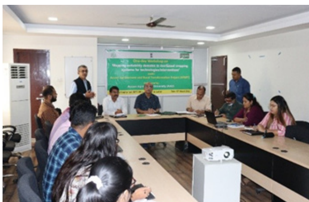
Participants of the one-day workshop on mapping suitability domains in rice-based cropping for technologies/ interventions

On March 30, 2022, a one-day workshop on mapping suitability domains in rice-based cropping for technologies/ interventions at the SIPC office, Guwahati was also organized. The main objective of this workshop was to familiarize the participants with how satellite-based mapping of rice-fallow areas & their soil moisture availability can significantly increase the agricultural output and get useful inputs from various organizations on the sowing requirements of different rabi crops. Through the mapping of rice-fallow areas, land productivity can be significantly increased by introducing short duration crops in the existing cropping systems which can further boost the rural economy. The workshop helped the participants to discuss and understand the different challenges faced by the farmers & planning agencies and how to address them through geospatial technology. The workshop was attended by 22 participants from different departments and agencies, such as the Department of Fisheries (DoF),