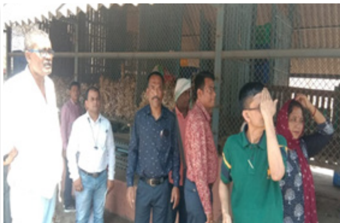
Field visits of the team

Sahyadri Farms was registered as a Farmer Producer Company (FPC) under the provision introduced in the Companies Act. It's a collective that is owned and managed by farmers that aims to ensure fair equity for everyone while providing value to the end consumer. FPC members were oriented with the journey of the organization from the export