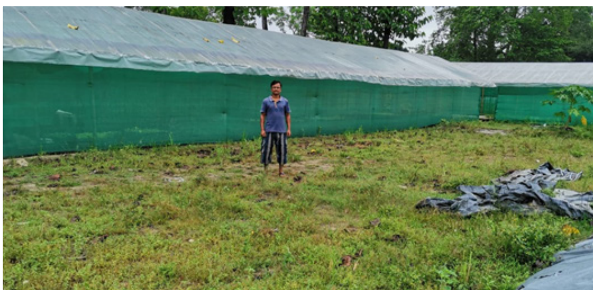
Bamboo based Vegetable Nursery Structure constructed under APART at Karunabari in Lakhimpur

Nursery Entrepreneur under APART for 2021-22. Accordingly, he was trained in Vegetable Nursery and allied nursery activities at Daffodil Horticulture College, Khetri under APART and provided guidance for the construction of low-cost bamboo supported Vegetable Nursery structures in a 100 sq.m. Abdul Alim took much interest in raising different types of vegetables such as King Chilli, Cabbage, Cauliflower, Brinjal, Knolkhol, Broccoli, Tomato, Pumpkin, flowers of different kinds and origins.