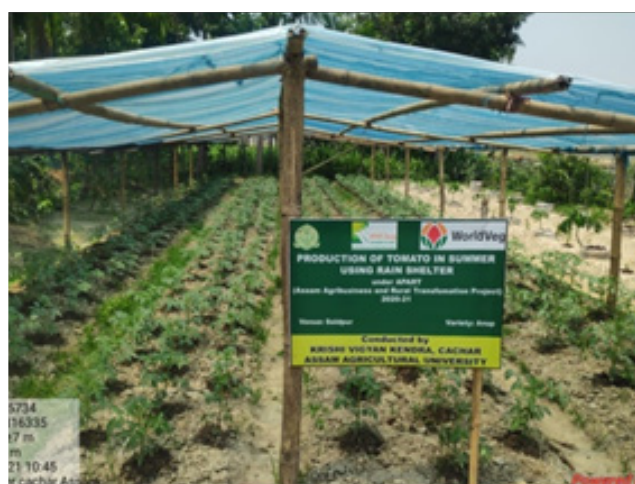
Summer Tomato Production under Rain shelter

In the North Eastern hill region, Assam is an important state in terms of Agriculture and Horticulture. Cachar is a district of Assam situated in the southern part of the state. It is amongst one of the most flood-prone affected areas in Assam. The farmers grow vegetables mostly in the Rabi season. Intense rainfall & unexpected flood are the two major challenges in the area for Kharif season vegetable production. To create a scope for