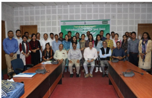
Participants of the 2 –day training programme on 'Introduction to GIS and field data collection'

The technical session began with a discussion on the methodology and criteria adapted for rice and stress-prone areas identification for the whole of Assam. In the second half of the session, the participants were given hands-on training on working