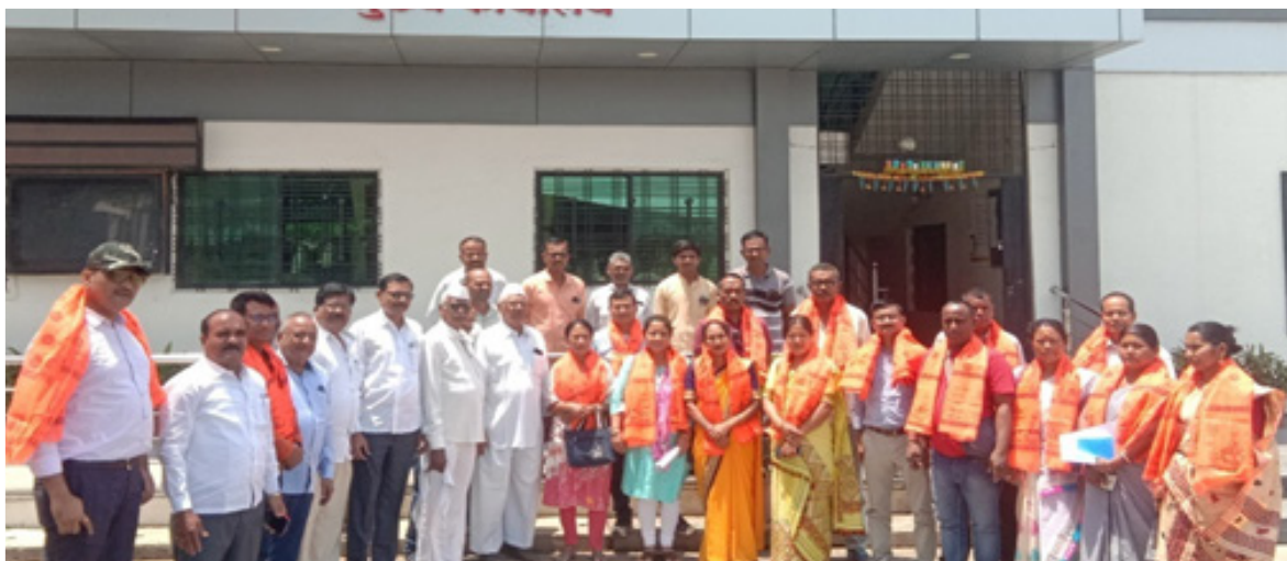
Visiting team at Saipravara FPO and APMC Rahata

Saipravara FPO was formed under World Bank Assisted MACP project and is considered as a model FPC Managed by the Board of directors successfully. The BODs from Assam could get more insights on developing their confidence to manage the various enterprises, to be undertaken under Common service Centers under APART. It also helped to understand the systematic process for running the FPO business, from the sharing from Saipravara FPO BODs. Then the team visited the APMC Rahata; a model