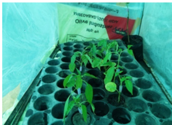
Seedlings inside Healing Chamber