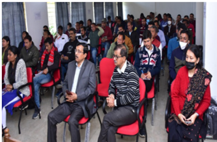
Glimpses of the exposure visit

India Coordinated Research Project on Rapeseed-Mustard (AICRP-RM) at RARS, Shillongani, Nagaon, Assam, working under ICAR-DRMR and on 24 Feb. 2022 at Gorukhuti, Darrang under ICAR-DRMR-OPIU (Agri)-APART project.