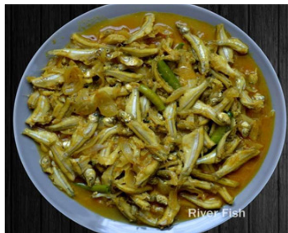
Small fish for better nutrition

The technical team from WorldFish extended technical support in the awareness programmes and educated the communities on how the locally available small fishes, especially small fish when eaten whole, are highly nutritious and contribute a wide range of micronutrients that benefit the health of women, adolescent girls, and children. It is pertinent to mention that fish is one of the cheapest sources of animal protein, which is available in the community